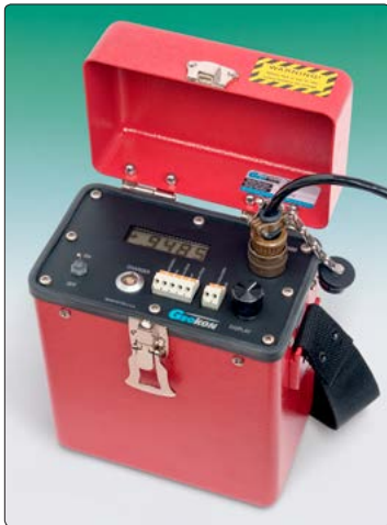
● The Model RB-500 MEMS Readout for use with the Model 6160 Tilt Sensors.