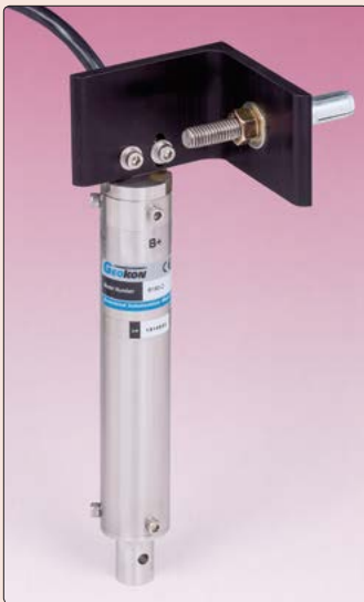
• Model 6160A-2 Biaxial MEMS Tilt Sensor with mounting bracket assembly.